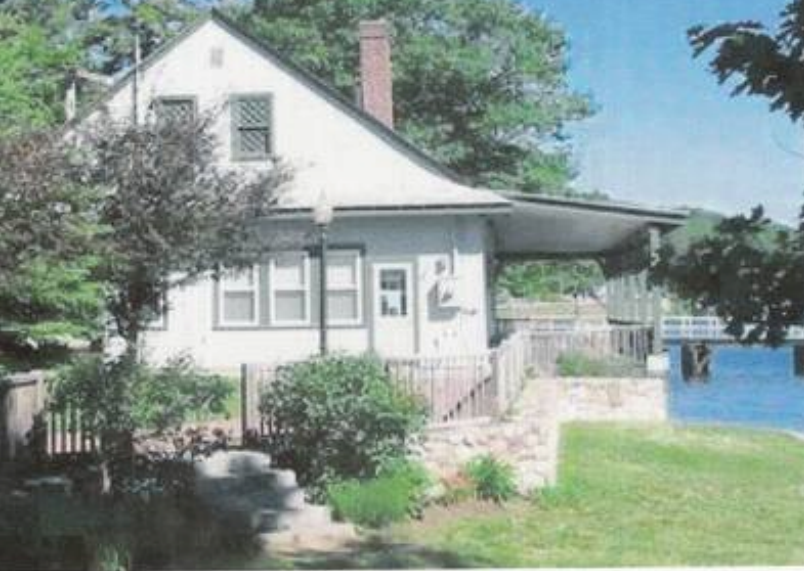
NOW and THEN - Now: Photo of the Alton Bay Community Center July 2004. Then: The B. & M.R.R. Station postmarked 1912.